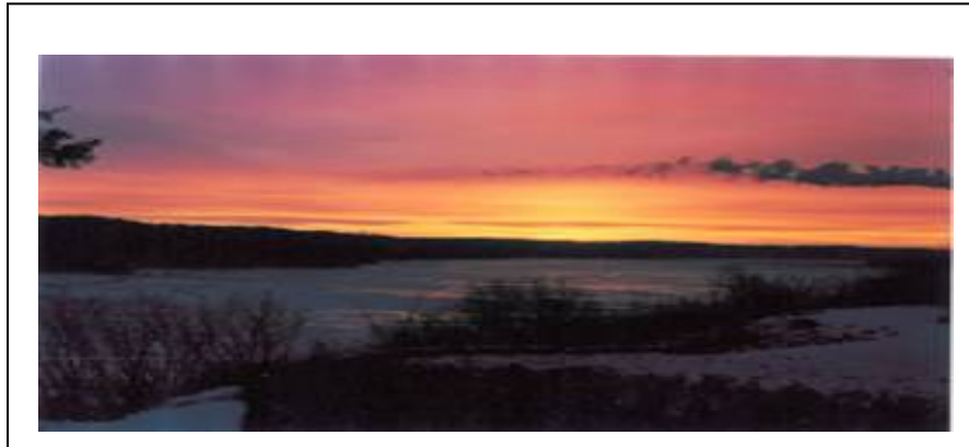
Photo: Sunset on the St. Croix River near Stillwater, Washington County, Minnesota The River Rushes On, National Citizen Review Panel Conference, May 21, 22, 23, 2008 – St. Paul, MN

As we are still looking for data, this committee has no recommendations at this time. We hope to have more solid findings and to form a recommendation in 2008.