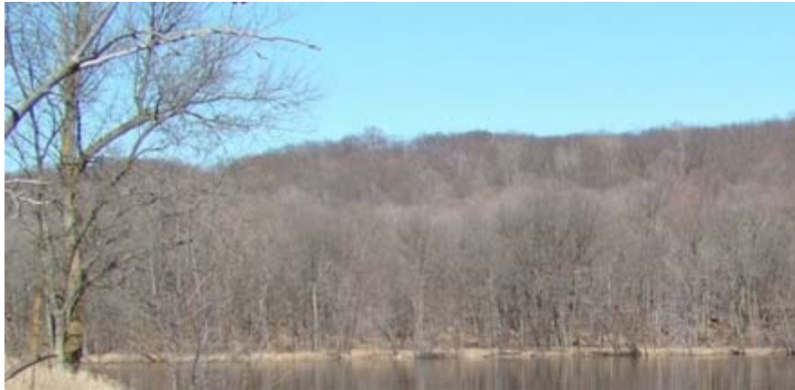
Wild River State Park, St. Croix River, Chisago County, Minnesota