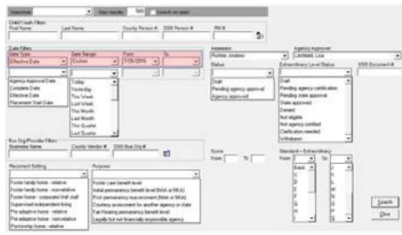
SSIS Worker Mentor Meeting 9/7/2016

Default filter includes MAPCY assessments with effective date in the past 30 days