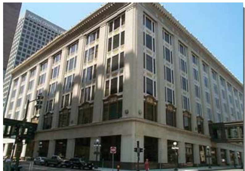
View of southeast corner of building looking northwesterly We occupy this corner of the first floor