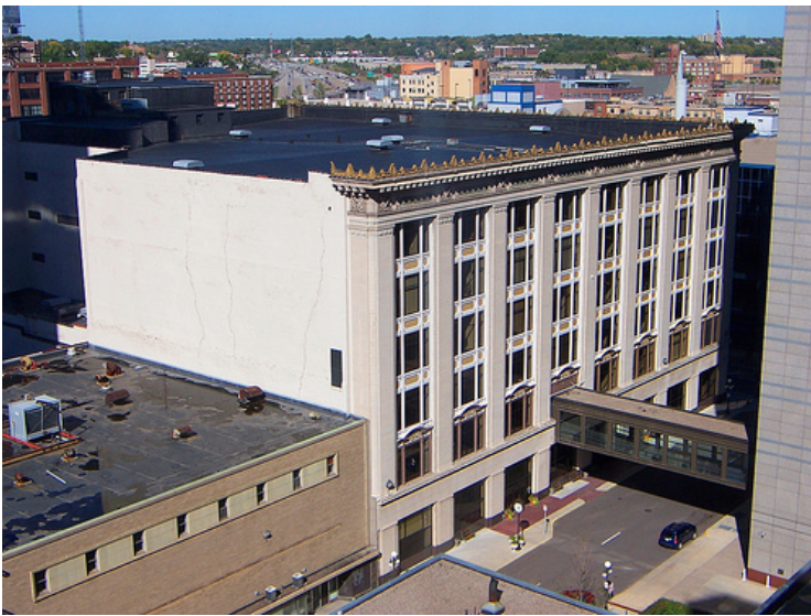
View of south side of building looking northeasterly